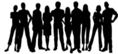
Message from the AGA Board