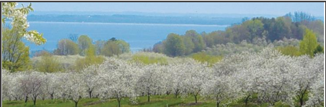
Spring in Traverse City, Michigan